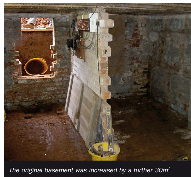
The original basement was increased by a further 30m 2

Large areas of underpinning were involved with the earth taken down to achieve a 2.5m head height. Two internal partition walls were built and some existing internal walls removed to suit the new internal layout.