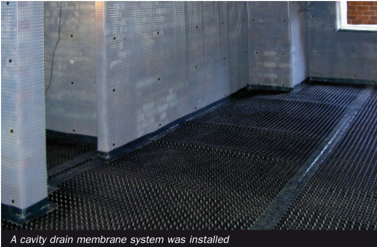
A cavity drain membrane system was installed

Dampco used Platon P5 cavity drain membrane on the walls and heavy duty P20 membrane on the floor. Cavity drain membranes work on the principle of allowing water to continue to penetrate the structure but control it in the air gap and divert it to a suitable drainage point. They do not allow pressure to build up against the internal construction and the air gap behind the membrane allows the structure to breathe. Once the membrane has been fitted, wall surfaces can be dry lined or plastered directly and floors can be screeded or a floating dry board system installed.