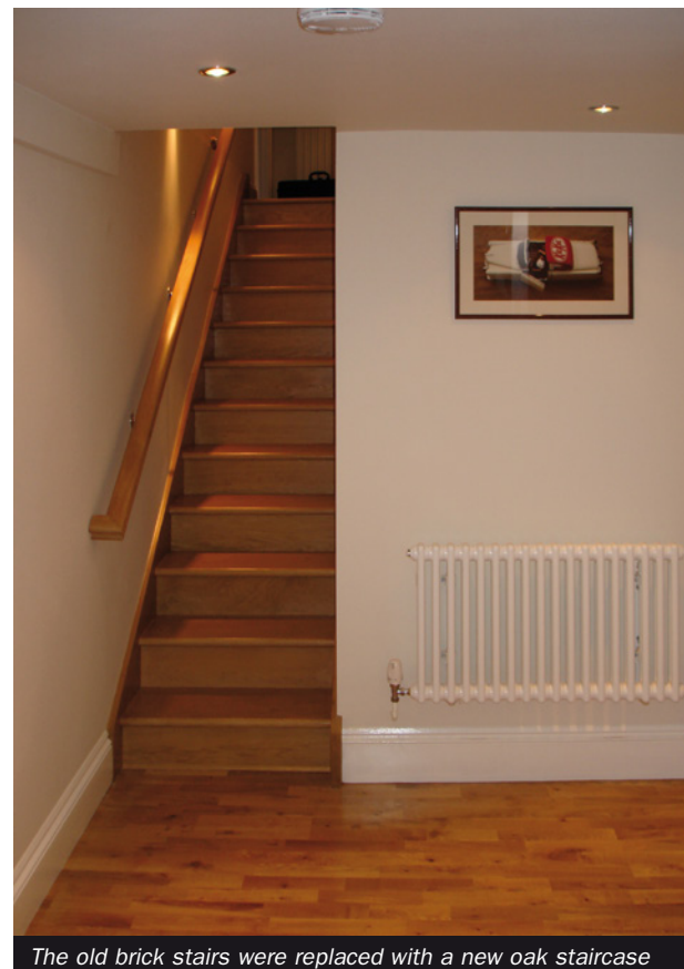
The old brick stairs were replaced with a new oak staircase