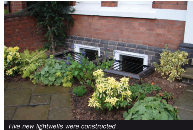
Five new lightwells were constructed